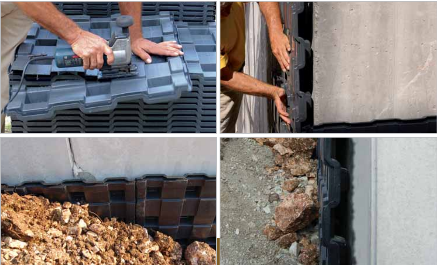
INSTALLATION OF DEFENDER IS QUICK AND EASY